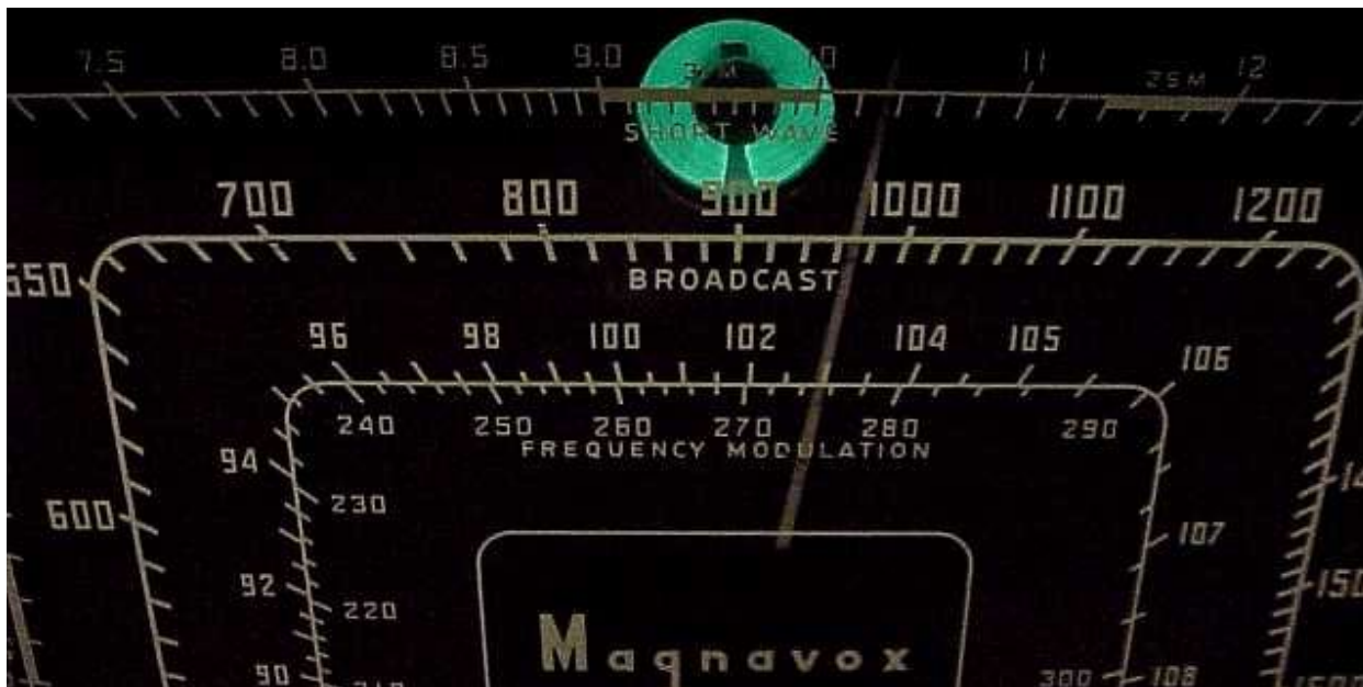
This dial is from one of the more expensive Magnavox Radio/Phonographs from about 1948 showing dual markings for both frequency and channels.

RDV's Bensalem translator W246AR can be heard at 97.1 on this radio. It could also be tuned to channel 246 on the lower number scale, putting it exactly at 97.1.