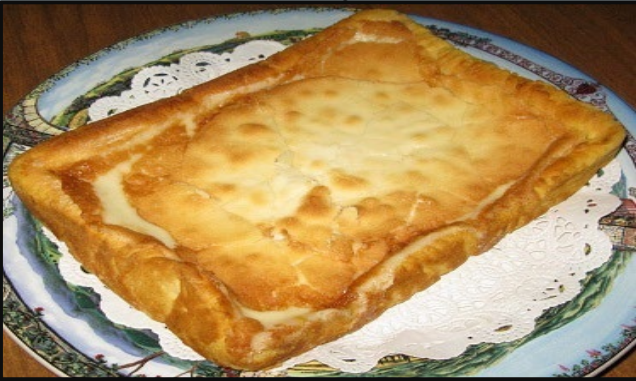
Philadelphia Butter Cake