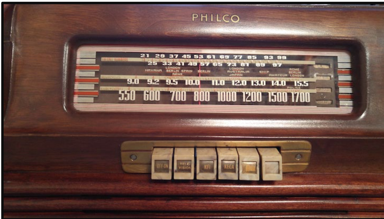
Philco model 42-350, Philco's least expensive AM-FM and short-wave radio which sold for $49.95 in 1942. The 21 to 99 MHz scale at the top was the 42 to 50 MHz FM band.